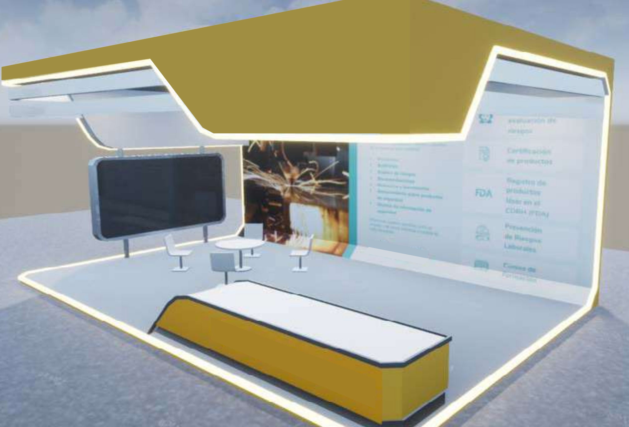
Stand with standard location and fully decorated with the brand image .